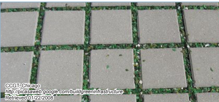
CCGT, Chicago