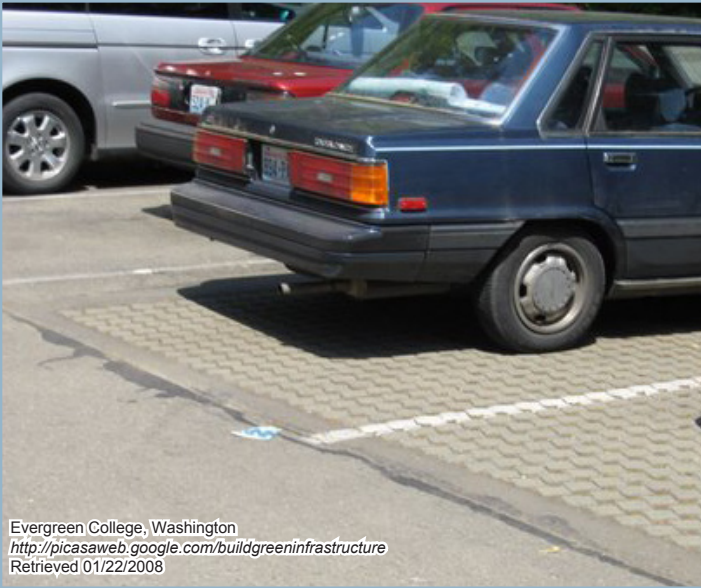
Evergreen College, Washington http://picasaweb.google.com/buildgreeninfrastructure Retrieved 01/22/2008